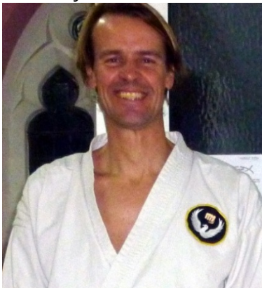
Instructor to the Plymouth Schools of Wadoryu Karate, Devon.