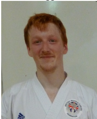
Leading Instructor to the Manchester Wadoryu Karate Club, Heywood, Lancashire.