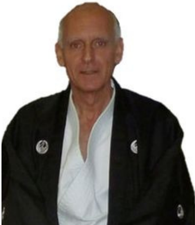
Honbu-Cho, Chief Instructor and Technical Director of British Wadokai. Devon.