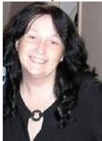
Assistant Director of Academia & Assessment.