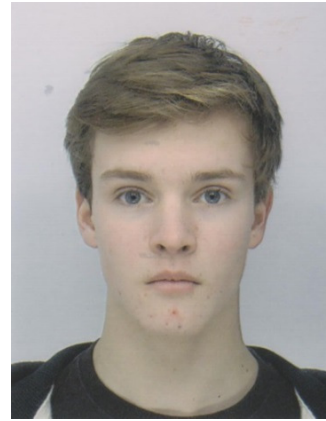
Instructor to the Plymouth Schools of Wadoryu Karate, Devon.