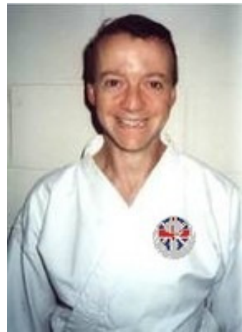
Assistant Chief Instructor and Senior Technical Director of British Wadokai and Senior Instructor of the Cranleigh Karate Club (Hakutsuru), Surrey.