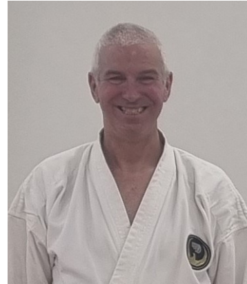
Assistant Instructor to Newcastle Wadokai, Tyne & Wear.