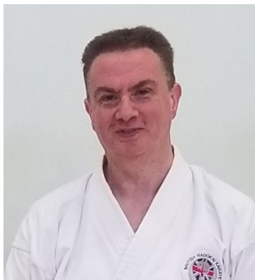
Instructor to the Zanshin Karate Club, Burgess Hill, Sussex.