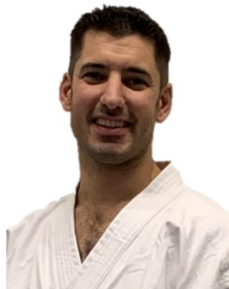
Senior Instructor to Kaiyo Wado Kai Karate Llangennech, Carmarthenshire.