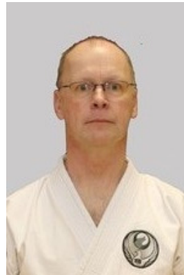
Instructor to the Grey Wolf Wadoryu Karate Club, Cirencester, Gloucestershire.