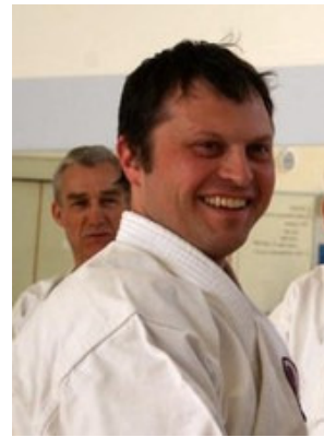
Senior Instructor to the Pomphlett Karate Club, Devon.