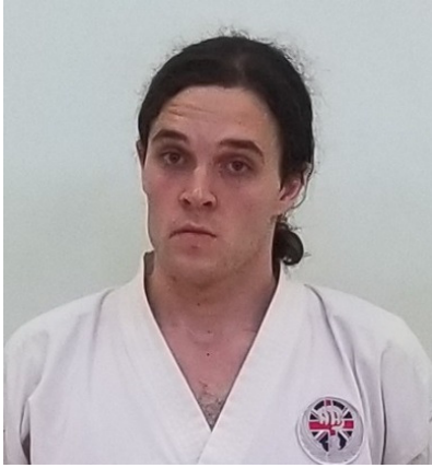
Assistant Instructor of the Cranleigh Karate Club (Hakutsuru), Surrey.