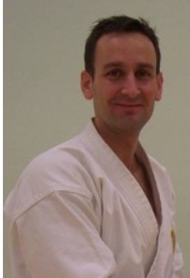
Assistant Instructor to the Kingslea School Horsham Wado Karate Club, Sussex.