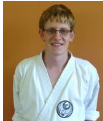
Instructor to the Grey Wolf Wadoryu Karate Club, Cirencester, Gloucestershire.