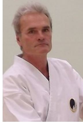
Assistant Instructor to the Kingslea School Horsham Wado Karate Club, Sussex.