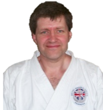
Assistant Instructor to the Zanshin Karate Club, Burgess Hill, Sussex.