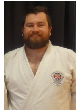
Instructor to Newcastle Wadokai, Tyne & Wear.