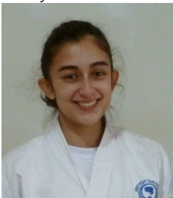
Instructor to Manchester Wadoryu Karate Club, Heywood, Lancashire.