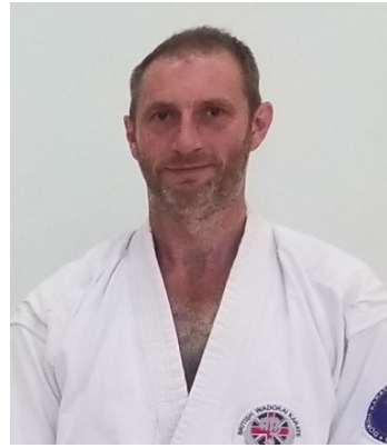
Instructor of the Kingslea School Horsham Wado Karate Club, Sussex.