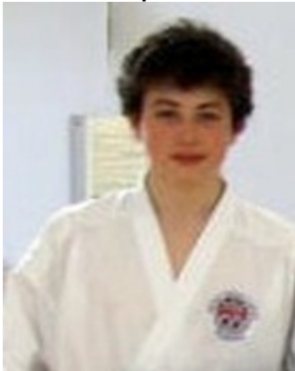
Assistant Instructor to the Zanshin Karate Club, Burgess Hill, Sussex.