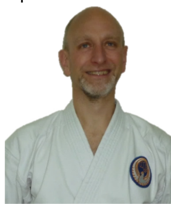
Assistant Instructor to the Plymouth Schools of Wadoryu Karate, Devon.