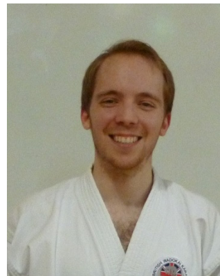
Senior Instructor to Zanshin Karate Club, Burgess Hill, Sussex.