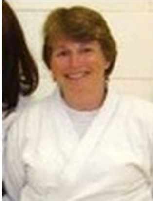
Assistant Instructor to the Cranleigh Karate Club and Cranleigh School Karate Club, Surrey.