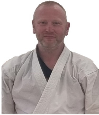
Instructor to Newcastle Wadokai, Tyne & Wear.