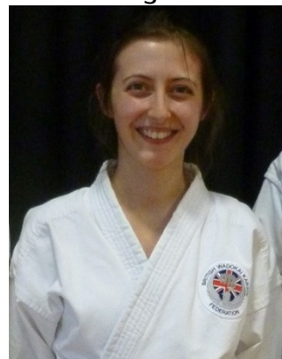
Assistant Instructor to Newcastle Wadokai, Tyne & Wear.