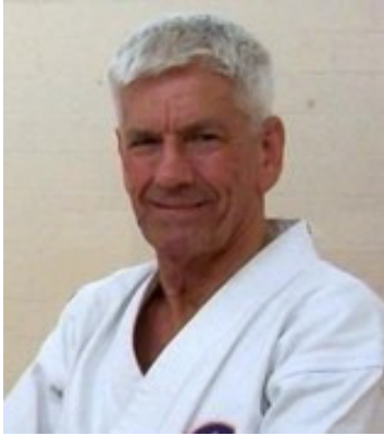
Senior Instructor of the Kingslea School Horsham Wado Karate Club, Sussex.