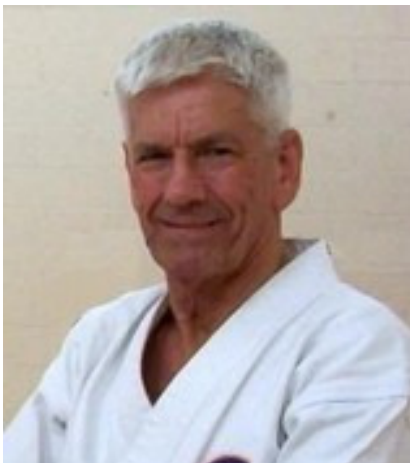
Director of Academia & Assessment.