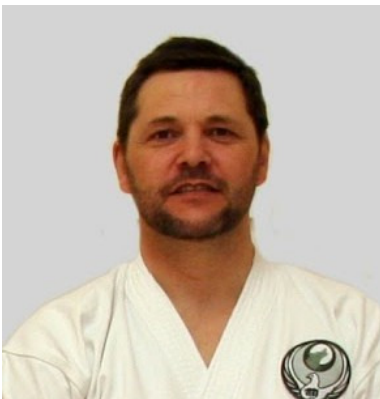
Instructor to the Grey Wolf Wadoryu Karate Club, Cirencester, Gloucestershire.