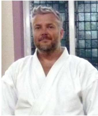
Assistant Instructor to the Plymouth Schools of Wadoryu karate, Devon.