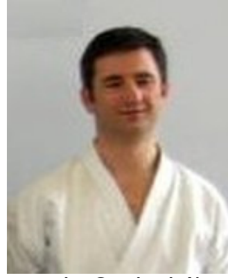
Instructor to the Cranleigh Karate Club.